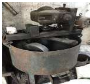
Fig.4 - Sand Mixer

moistened, typically with water, but sometimes with other substances, to develop the strength and plasticity of the clay and to make the aggregate suitable for molding. The sand is typically contained in a system of frames or mold boxes known as a flask. The mold cavities and gate system are created by compacting the sand around models called patterns, by carving directly into the sand, or by 3D printing.