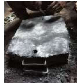
Fig.5 – sand casting mould